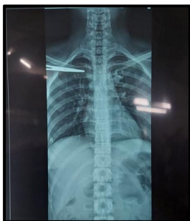
Fig. 1. X-ray of chest (A-P view)