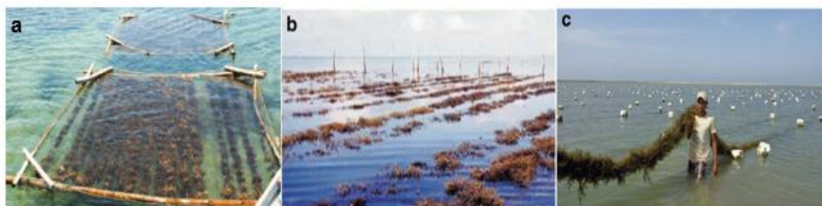
Fig. 2 Different methods of commercial seaweed farming. a Floating bamboo raft method, b long-line or monoline method, c Tube-net method

enough sunshine (Fig. 2b). To prevent seedling loss that can occur if ropes are seeded on the coast and dragged into the sea, seeding in this situation is typically done in the water itself. This farming method is especially advised in regions with low grazer densities and moderate wave action. It is widely practiced in Tamil Nadu's South Ramanathapuram, Pudukkottai, and Tuticorin districts [24].