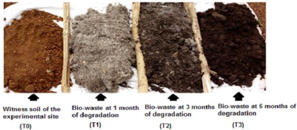
Fig. 2. Soil and organic manure used on the experimental site