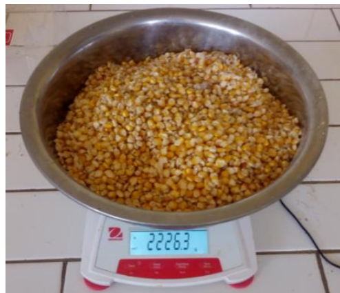
Fig. 3. Variety of corn coded F8128 used for experimentation

parameters measured were plant height (cm) and collar diameter (cm). At the production level, the ear weight (kg/ha) and grain yield of corn in (T/ha) were measured.