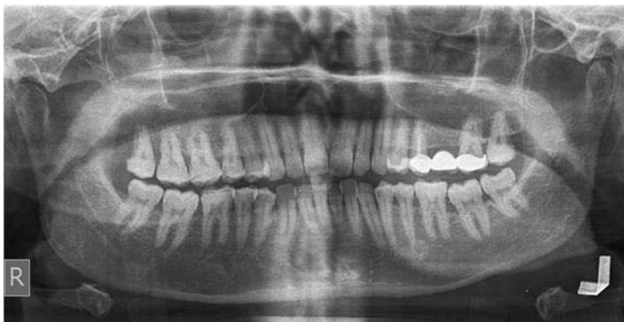
Figure 2. OPG showing horizontal bone loss in relation to 17, 18, 35-38

The most common etiologic factors associated with SCC are smoking, smokeless tobacco use, chewing pan (a combination which includes calcium hydroxide, areca nut, and betel leaf). Factors which play a less important role are exposure to ultraviolet radiation, oncogenic viruses, iron deficiency, candidal infections and immunosuppression. Tobacco and alcohol are the two best known collaborative risk factors of OSCC. 2,8 In the present case, the patient had a history of smoking. The most common sites of OSCC are buccal mucosa, floor of the mouth, tongue, alveolar ridge and the hard and soft palates, whereas gingiva, retromolar area and the buccal and labial mucosa are less frequently involved. 9,10 In the present case, OSCC was manifested on the gingiva which is a rare site to occur. OSCC of the gingiva more frequently involves the