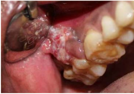
Figure 1. Erythematous, sessile growth in the region of #17 and #18.

tion it was soft in consistency and tender and was bled profusely on probing.