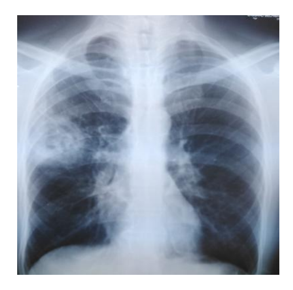
Fig. 2. An X ray showing cavities wthin consolidation of right upper lobe