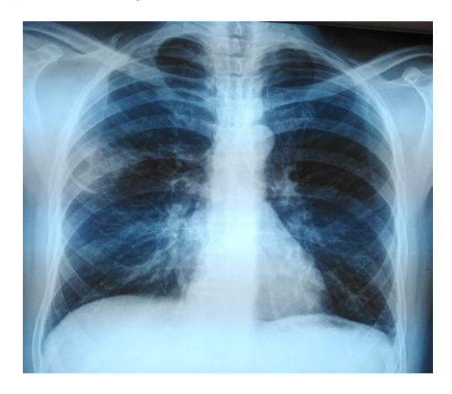
Fig. 1. An Xray showing a peripheric right infltrate

Hyperglycemia was controlled initially with insulin, followed by oral hypoglycemic agents. Repeat bronchoscopy performed 2 weeks after discontinuation of amphotericin B therapy confirmed clearing of the endobronchial mass. Four months later the initial presentation, CT scan showed a regression of the lesion. (Fig. 6).