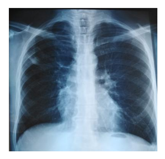
Fig. 5. An X ray showing a regression of the consolidation