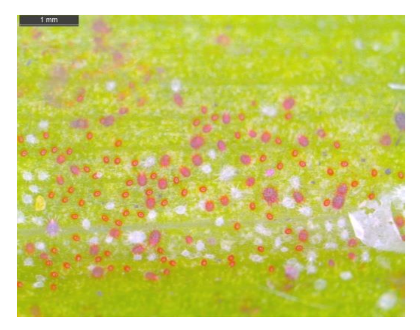
Fig. 1. R. indica colony on leaf lamina

As shown in Table 1 and Fig. 4, heavily infested leaves have 9.50 mg/gm of total nitrogen content. The per cent reduction of 'total nitrogen' in infested leaves could be recorded as 51.92±0.72% when compared to uninfested leaves and also the infested leaves disclosed 12.18±0.24 mg of total nitrogen/gm (Table1 & Fig.4.) when subjected to statistical analysis ( the t-test at 0.05% of significant level- see Table 2). Earlier studies on Coleus owing to infestation by another species of tenuipalpid mite viz. Brevipalpus obovatus by Meena and Sadana [11] also could establish similar loss in