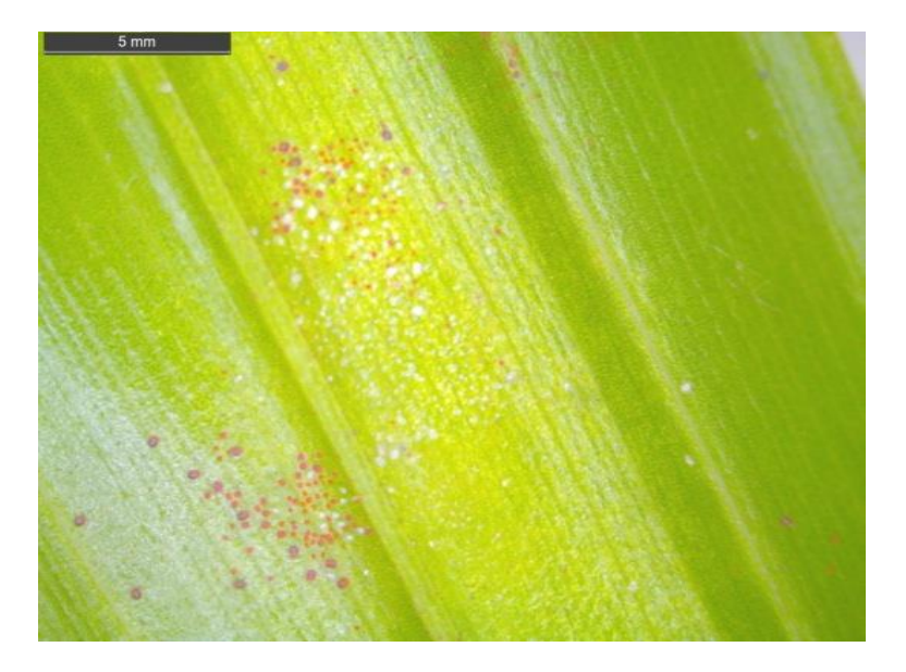
Fig. 2. Yellow colouration on leaf due to infestation